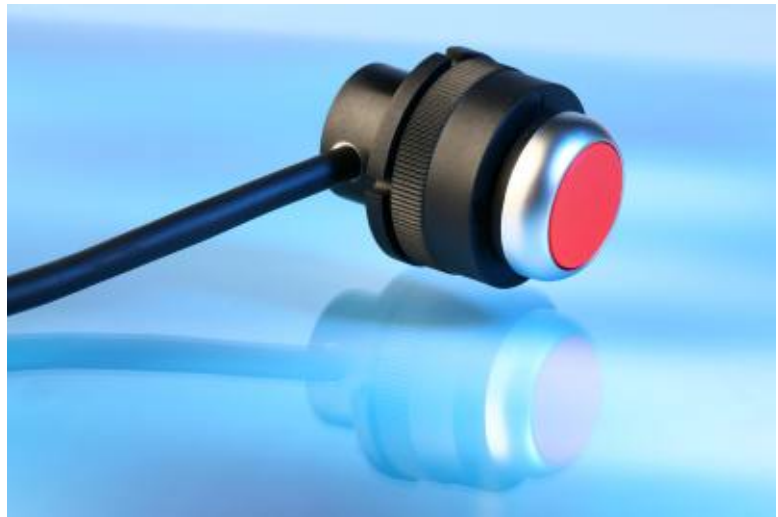
Figure 2. MEDER's MK25 Ex-Approved Reed Sensor

Many facilities, particularly manufacturing environments where dust particles or explosive atmospheres may exist, represent real challenges when it comes to electronic circuitry and switching contacts. Any type of arc can set off an explosion dramatically damaging the facility. Reed switches represent a real switching solution with their hermetically sealed contacts.