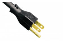
5-15P Straight Blade