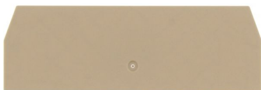
End plate, Width: 1.5 mm, Colour: Beige