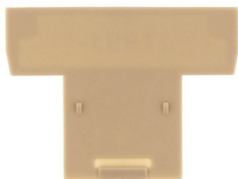
Insulation plate, Colour: Beige