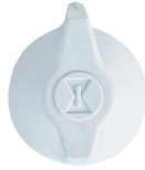
146MT574 Knob-Wall Switch FD Series - White