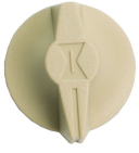
146MT573 Knob-Wall Switch FD Series - Ivory