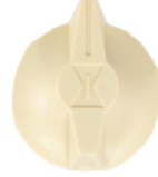
146MT575 Knob-Wall Switch FD Series - Almond