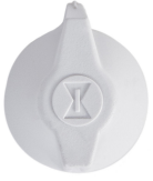
146MT577 Knob-Wall Switch FF Series - White