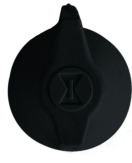
146MT579 Knob-Wall Switch FF Series - Black