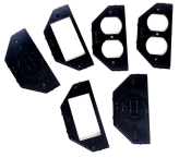
WP217 Double-Gang Inserts (6)