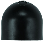
6LV1352 Light Shield Accessory for EK4036S, EK4436SM, K4000 Series Button Photocontrols