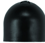
6LV1352 Light Shield Accessory for EK4036S, EK4436SM, K4000 Series Button Photocontrols