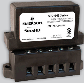
Plug-in Module with Standard Base