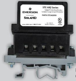
Plug-in Module with Optional DIN Rail Mounting Clip